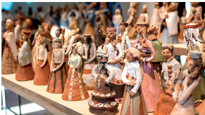
Travelling exhibition "Our 100 Folk Maidens for Latvia's Centenary".